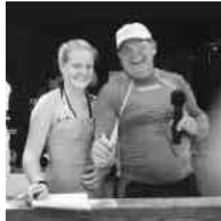
...WORKED WITH MY DAUGHTER