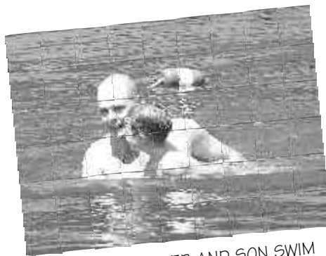
.....TOOK A FATHER AND SON SWIM