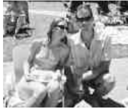
...BASKED IN THE SUN