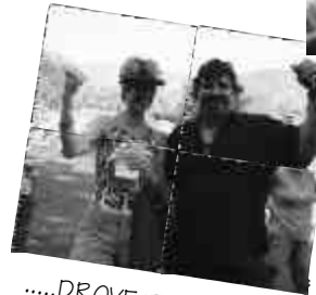
....DROVE THOSE NAILS FASTER THAN ANYBODY ELSE