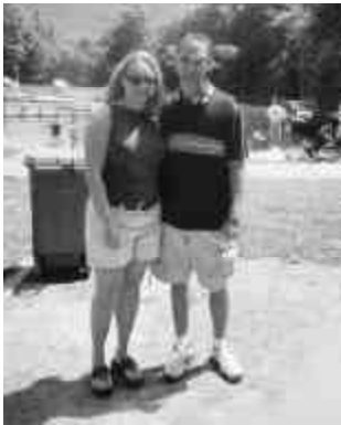
...HAD A DATE WITH MY WIFE