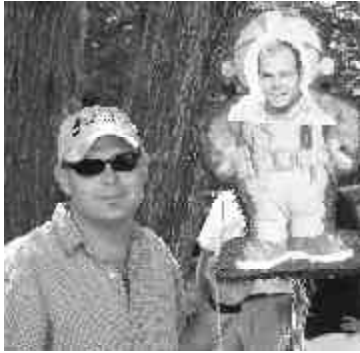
.....TOOK, YET MORE ABUSE