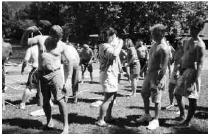
.....PLAYED LOTS OF FUN AND 'INTERESTING' GAMES.