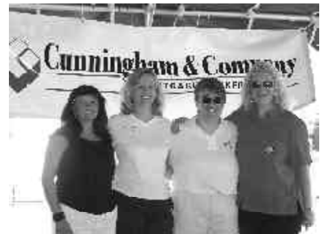
.....CUNNINGHAM & CO. DISHED UP SOME DESSERTS