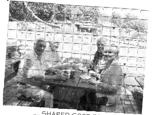
.....SHARED GOOD FOOD