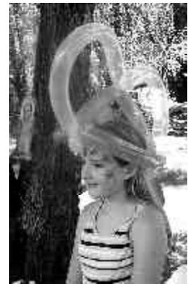
.....WORE A CUSTOM-BALLOON HAT