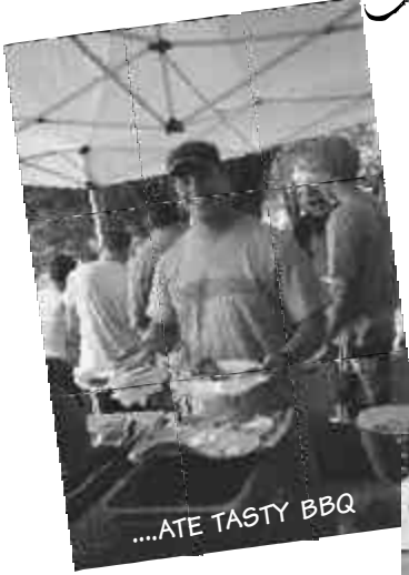
...ATE TASTY BBQ