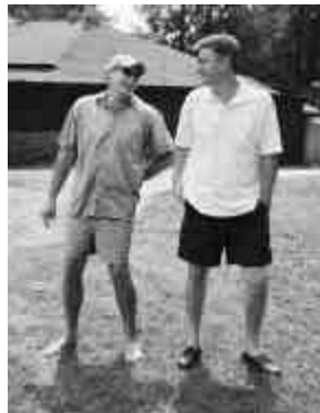
.....SO YOU WANT TO BE AN HBA PRESIDENT?

STOCK Building Supply a WOLSELEY company