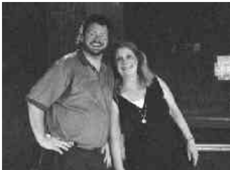
.....HUNG OUT WITH THE DJ