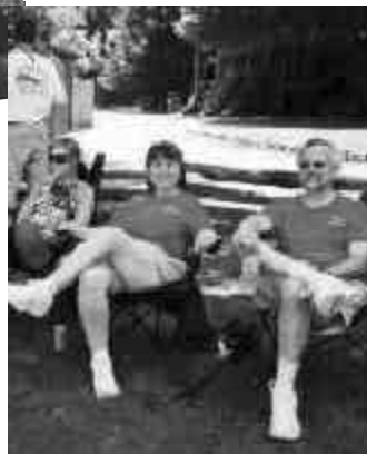
...HAD A CHANCE TO WEAR OUR MATCHING T-SHIRTS