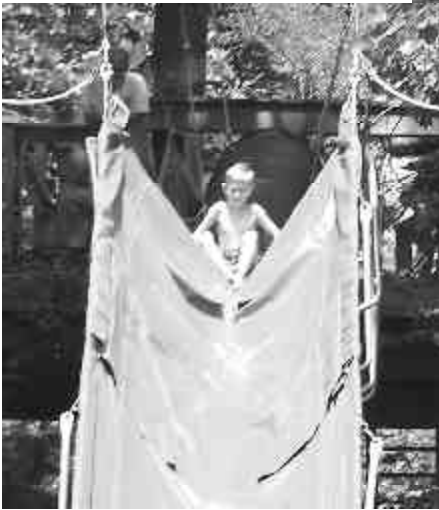
....LOOKED WAY DOWN THE BELLY WASHER