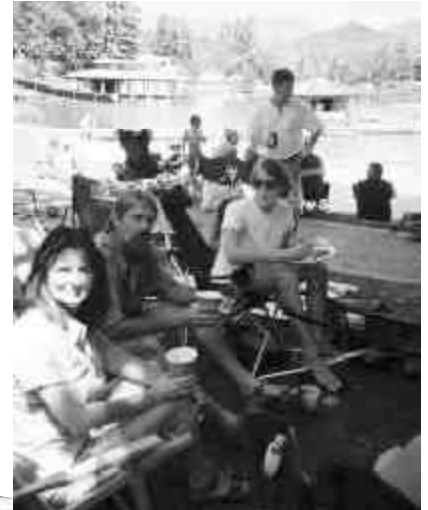
...ENJOYED SOMETHING COOL TO DRINK